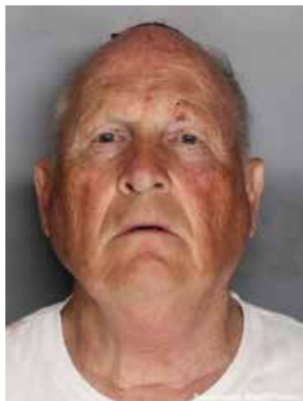
Joseph James DeAngelo

This past April, 11 years after my initial work on him, the stunning news broke that the elusive Golden State Killer (aka East Area Rapist) had finally been captured after 40 years of eluding arrest. I was overwhelmed with relief. In an ironic display of divine timing, the news broke on my birthday, and my phone starting buzzing at 6:00 a.m. Seeing the photos of 72-year-old Joseph James DeAngelo handcuffed to a wheelchair instantly turned the frightening monster who had taken up residence inside my head back into a human being. He